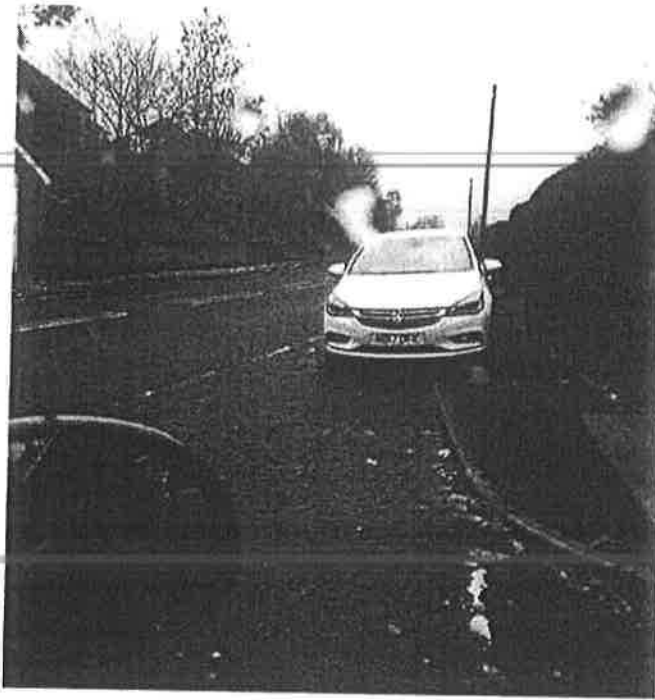
View trying to exit from Burnop Tce onto main road Hookergate Lane